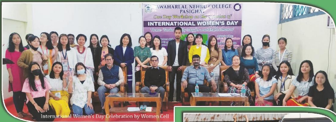
International Women's Day Celebration by Women Cell