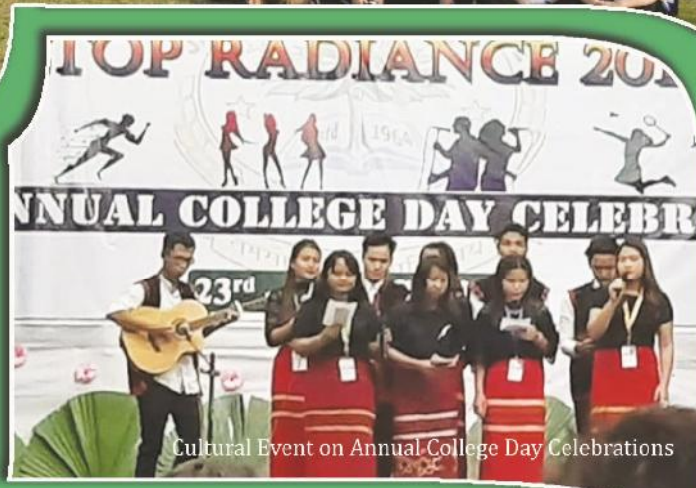
Cultural Event on Annual College Day Celebrations