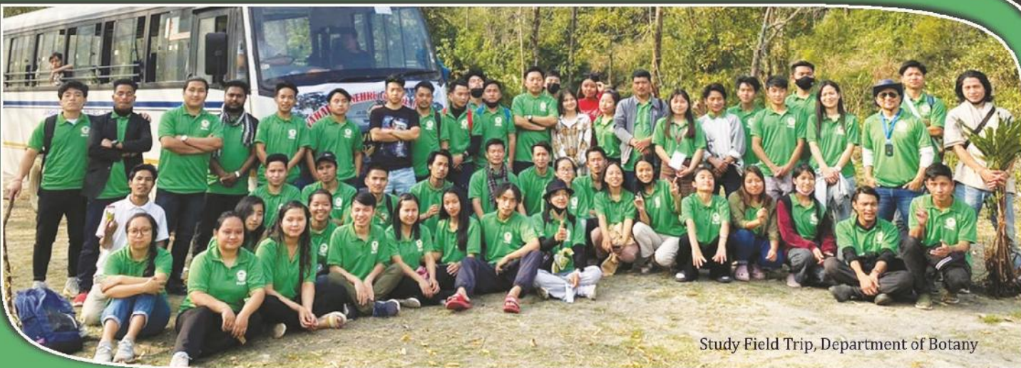
Study Field Trip, Department of Botany