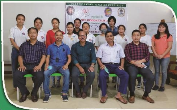
College Level Quiz Competition: Organizers with Winners