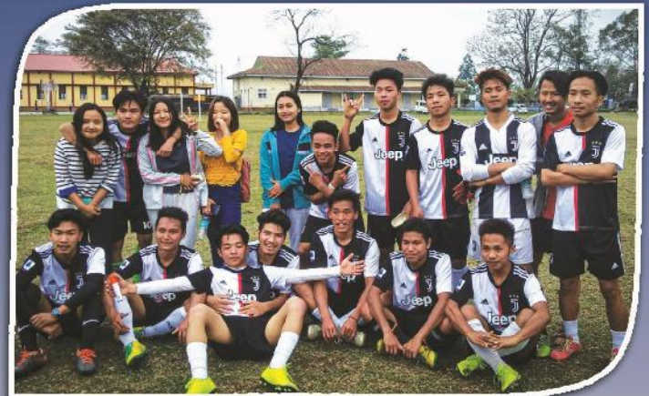
College Football Team