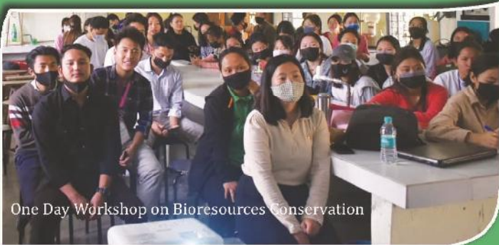
One Day Workshop on Bioresources Conservation