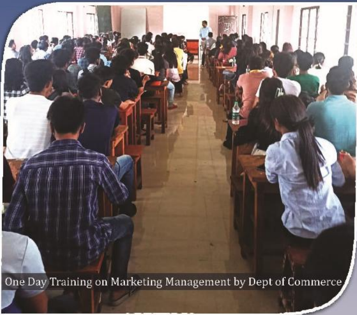
One Day Training on Marketing Management by Dept of Commerce