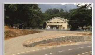
View from NH-52