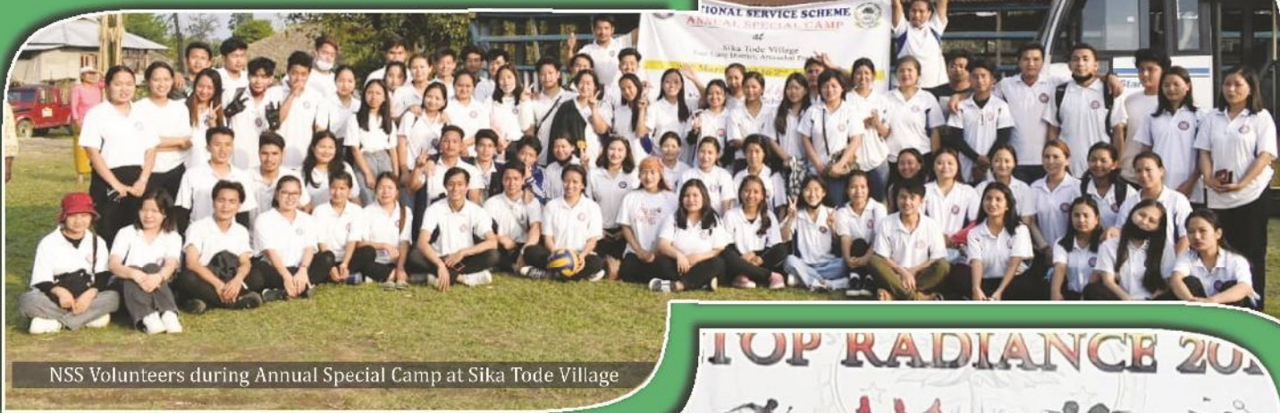
NSS Volunteers during Annual Special Camp at Sika Tode Village