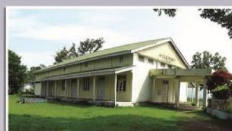
Auditorium (Lower Campus)