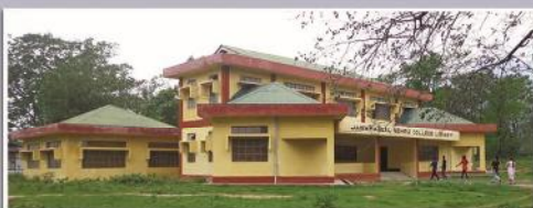
College Library (Upper Campus)